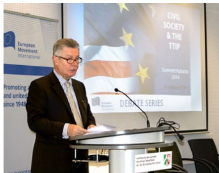
Karel De Gucht, Commissioner for Trade, European Commission, addresses a European Movement audience

concerning transparency in TTIP negotiations. We continue our work on TTIP through events and policy outreach.